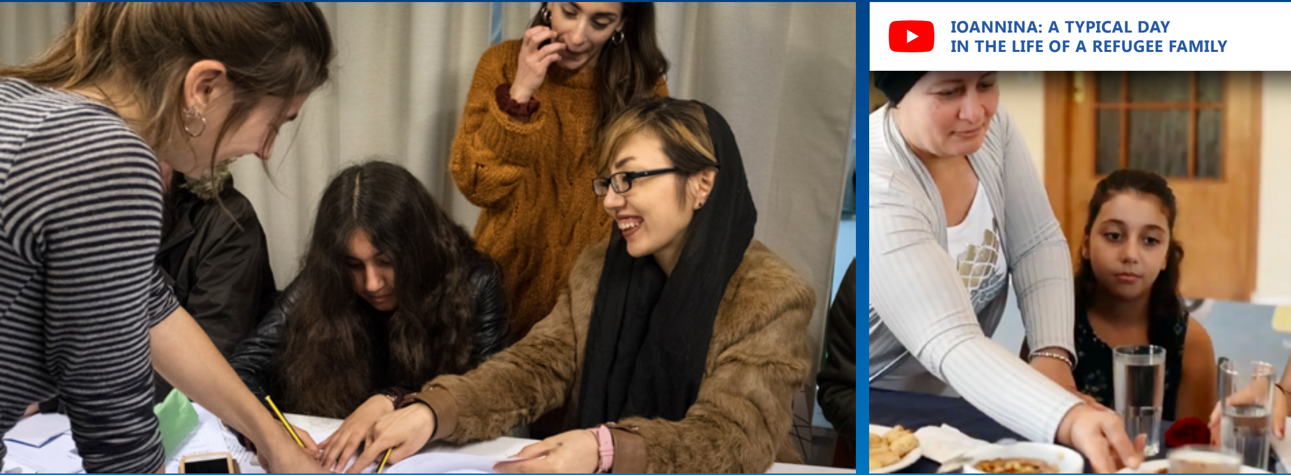
IOANNINA: A TYPICAL DAY IN THE LIFE OF A REFUGEE FAMILY

TdH bought baby strollers and cots, which was important for two reasons: 1.It helped mothers gain more independence. 2.The cots ensured children had a safe place to sleep reducing the likelihood of sudden infant death syndrome (SIDS) or accidental suffocation.