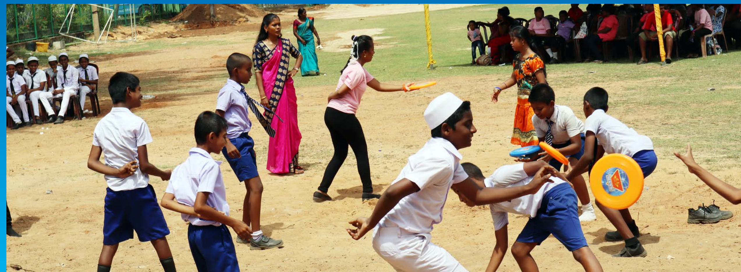
INTRODUCING SPORTS FOR PEACE INCLUSION AND RECONCILIATION (INSPIRE)